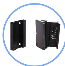
Optional RF UB55 universal mounting bracket