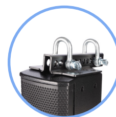
Optional RF B55 omnimount bracket & flying frame